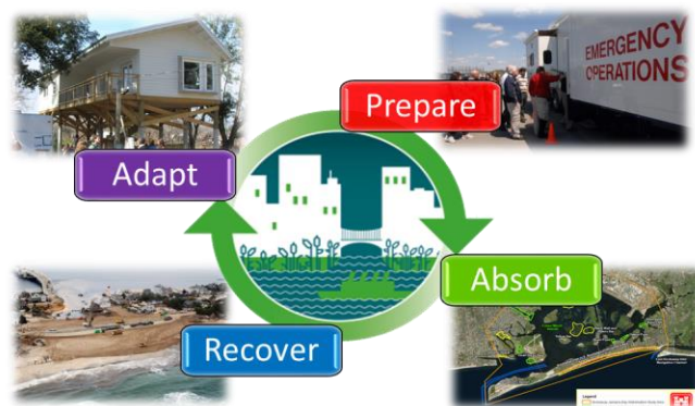
Figure 1.1 – USACE Resilience Principles

USACE recognizes four principles of resilience: Prepare, Absorb, Recover, and Adapt; referred to as the P-A-R-A Principles (Figure 1.1). Individually, each principle guides actions to improve resilience. Together, the principles demonstrate the life cycle needed to maintain and ensure resilience, establishing a framework for understanding resilience across the organization. Detailed descriptions of each principle are provided in Table 1.1.